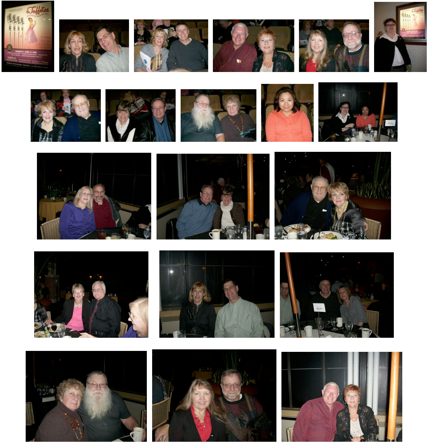
The 2008 Holiday Party was celebrated by Dinner and a Show at Pheasant Run Theater to see 'The Taffetas' on Saturday, February 21, 2009. The Taffetas are a girl group from the '50's that are appearing on television for the first time. The show was terrific and the food was delicious. We had 20 people in attendance. A wonderful time was had by all and seemed to go over well. Everything was still festive even though the holidays were behind us.