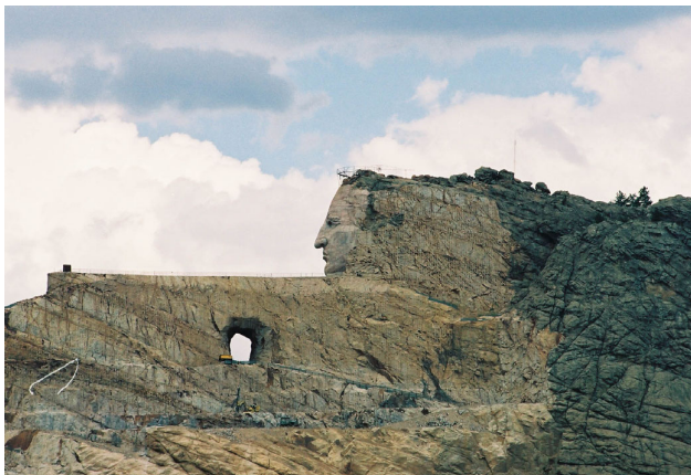
Crazy Horse Monument. The hole in the center is ten stories tall, and large enough to fit the Mount Rushmore Monument

Monday I left the hotel early to be at the East Gate of Yellowstone when it opened at 8:00am. When I pulled up to the guard shack, a young man looked at truck, the trailer and me and then said, "What year Corvette do you have in the trailer". I forgot, I put on a Corvette T-Shirt that morning. I smiled and told him I had TWO Metropolitan's in the trailer. A real puzzled look came over his face, then he smiled and said have a nice day. The drive into Yellowstone with the truck and trailer was fun. The east entrance road is under construction, down to one lane in spots, no guardrail, very straight up! If you remember the forest fires that went through Yellowstone a few years ago, WOW, it sure did a lot of damage. It was really spooky with all the charred, burned trees standing, and all the new growth coming in under them. But, the drive through Yellowstone was beautiful and I exited the south entrance for a drive through Grand Teton National Park, into Jackson Hole, WY.