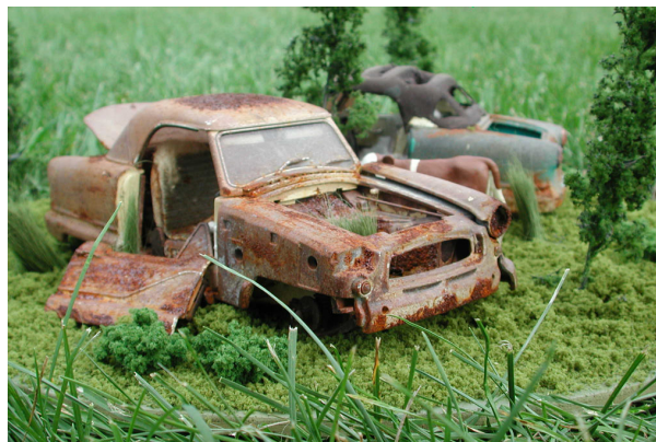
Two examples of the fine unconcours-quality work done by Rust R Us and Rusto DeRestorations.

I imagine more are sitting in fields looking like this than how they look sitting in the Highway 61 boxes. Plus, no two are ever the same. See more at http://www.rustrus.com