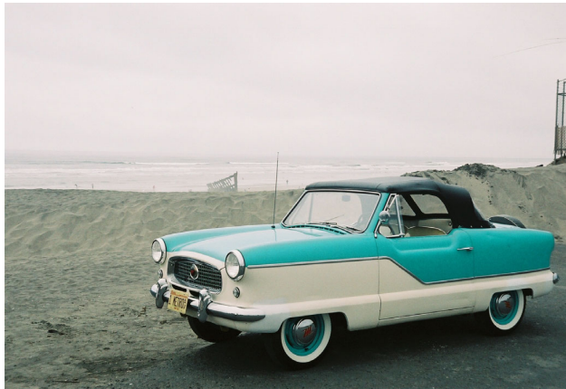
Gary Bosselman's Concours-Winning Metropolitan takes the beach in Astoria.

Early Sunday morning I left for Cody, Wyoming, my next overnight stop. By now, we are getting into the hills and mountains. The truck is grunting going up the mountains, but enjoyed the coasting back down. I got off I-90 at Buffalo, WY and drove through Big Horn National Forest into Worland, WY, then north to Greybull, WY and west into Cody, WY. Absolutely a beautiful drive through Big Horn National Forest, with Powder River Pass being over 8,000 feet above sea level, down to Worland, the high plains desert. I arrived in Cody just in time for dinner and sight seeing. I ate dinner at Buffalo Bills daughter's Hotel called Erma's? Walked through town and then retired for the evening.