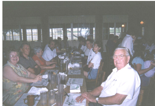
The Illini Mets at White Fence Farm