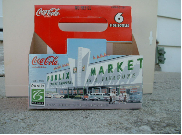
The Met is in the middle of the parking spots.